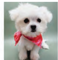
MALTESE PUPPIES Adorable males and females, toy or teacup sizes, shots and papers. Call 718-306-4136