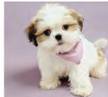
SHIH-TZU PUPPIES Beautiful Males & Females Price to Sell Call 718-306-4136