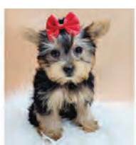
YORKIE PUPPIES ADORABLE, pure breed, toy & teacup sizes. Call 718-306-4136