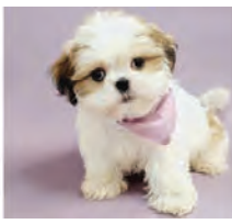
SHIH-TZU PUPPIES Beautiful Males & Females Price to Sell Call 718-306-4136