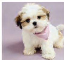
SHIH-TZU PUPPIES Beautiful Males & Females Price to Sell Call 718-306-4136