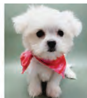
MALTESE PUPPIES Adorable males and females, toy or teacup sizes, shots and papers. Call 718-306-4136